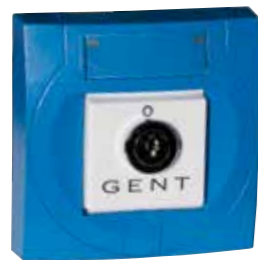
Loop powered key switch operated interface