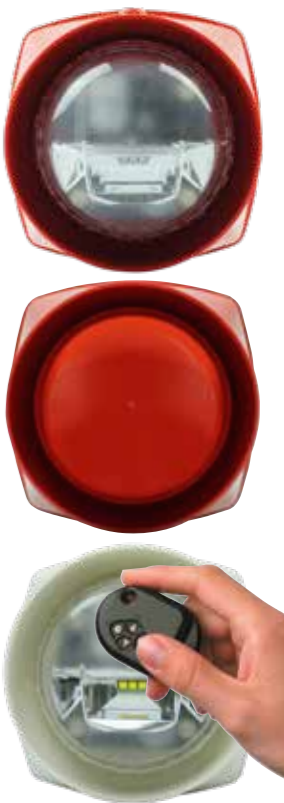
HandiLink Infrared remote control to adjust the volume remotely