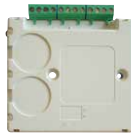
Loop powered 4 channel interface

The new comprehensive range of Vigilon interfaces has a neat compact design casing to give maximum installation flexibility. The range includes low voltage and mains switching variants to meet all application needs. All variants can be installed as either DIN rail mounted or housed in a Vigilon style enclosure. All interfaces are compliant with EN 54 part 18.