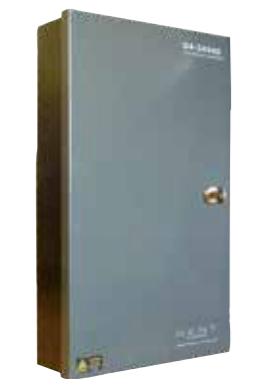
Mains powered interface