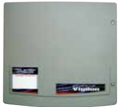
Loop Powered Mains Switching Interface