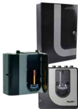
Air Sampling Detection

This type of intercom system allows emergency services to be in constant contact with the people in the refuge areas who seek assistance. The Equality Act (formerly The Disability Discrimination Act) made it the responsibility of all companies, nationwide, to ensure that access to buildings and services is available to everyone – there must be no discrimination.