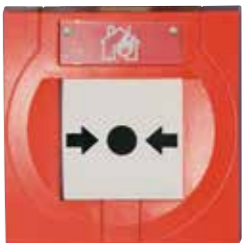
Vigilon Manual Call Point