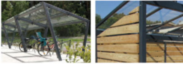
Bike Shelter Contemporary angular steel framed bike shelter with glass, metal or timber roof construction. Optional enclosed sides and lockable compartments. Powder coated RAL 7016