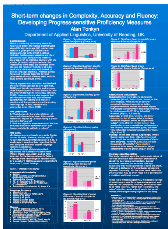
Figure 2. The academic poster analysed.

Following Hyland's (2000, 2004) interpretation, metadiscourse is seen as a way of understanding how writers express their interpersonal standing and orientations towards their text and their readers. The text found in an academic poster belonging to the discipline of Applied Linguistics (Figure 2) and presented at an international conference by a Senior Lecturer of the University of Reading was searched for metadiscourse devices.